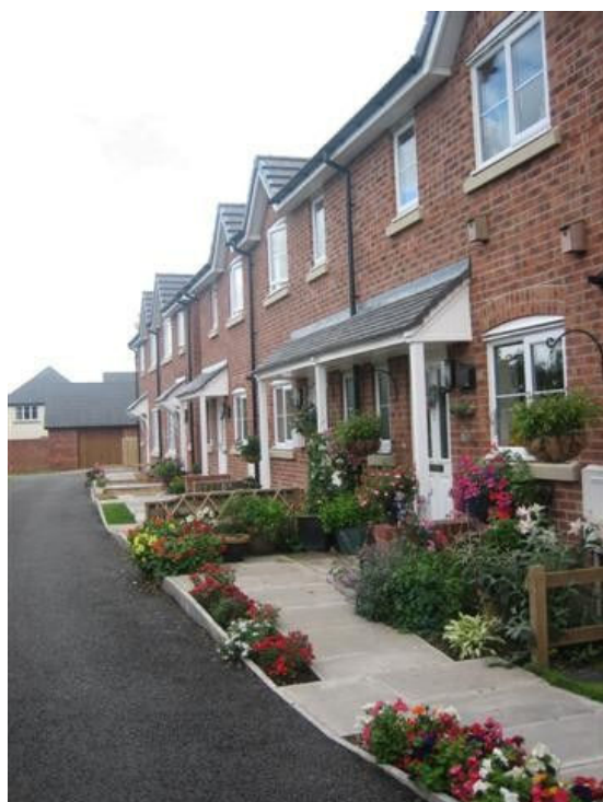
Oak Gardens Bunbury

A resident of one of the new homes, has commented "These fabulous, well built homes, with energy saving features such as solar panels and energy efficient central heating as well as excellent insulation, which makes them economical to run which is a blessing in these financial times. My husband and myself were living in Bunbury, but following the collapse of our business we were in great danger of having to leave because we could not afford to continue living here. As it is we are now part of a small community who get on well and are always available to help one another. The children here range from teenagers to a baby born shortly after her parents moved in. My neighbours say that had these homes not become available they would have been forced to move out of the area, and an important section of the next generation may have been lost to Bunbury forever."